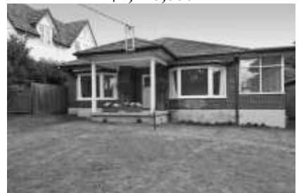
12 MALVERN AVENUE, ROSEVILLE $1,280,000