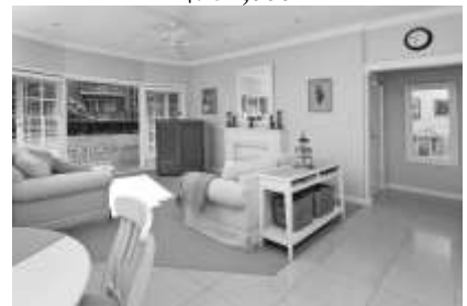
6/8 LARKIN STREET, ROSEVILLE $601,000