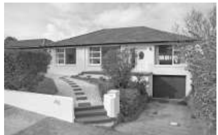
196 BOUNDARY STREET, CASTLE COVE $951,000