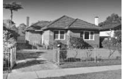
23 ADDISON AVENUE, ROSEVILLE $1,110,000